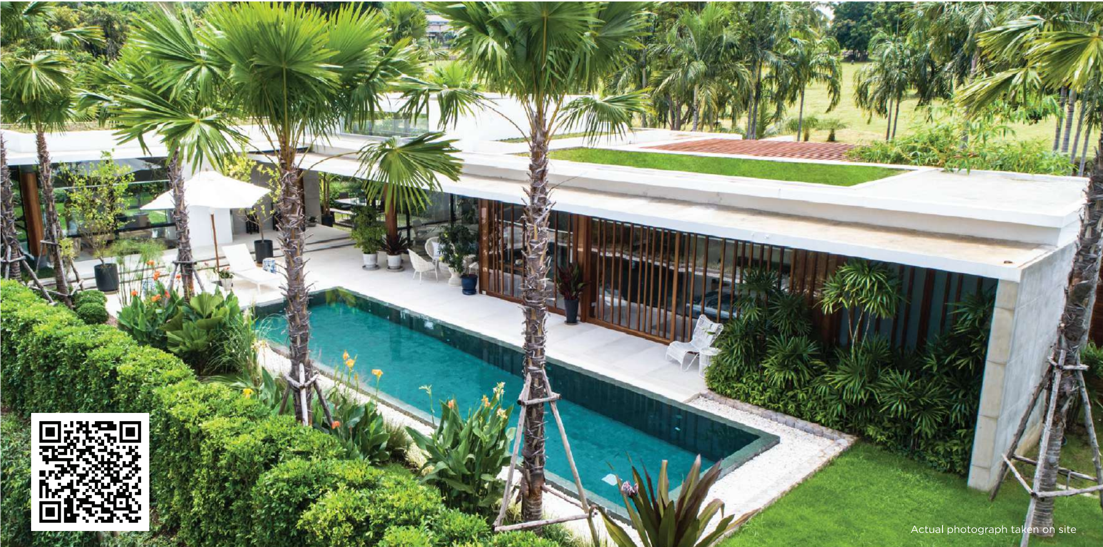
Actual photograph taken on site