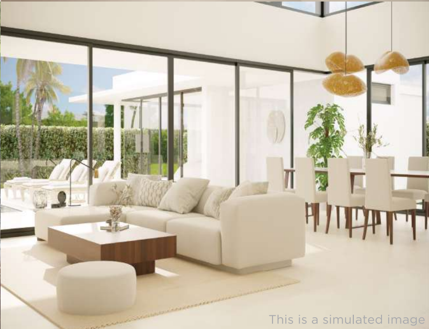
This is a simulated image

The Pool Villas, designed to compliment the natural surroundings, are the result of a philosophy that puts the quality of life at its heart. Featuring a private pool, steps away from your bedroom, a second terrace perfect for your weekend BBQ, and extensive living areas that open up on 2 sides, the result is a blurred distinction between indoor and outdoor spaces. The extensive gardens create the feeling of always being present in nature wherever you are in the villa.