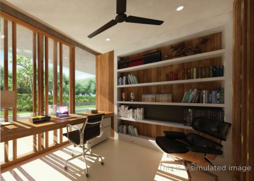
This is a simulated image